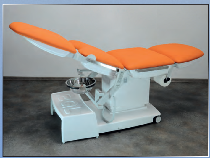
ACCESSORIES: Built-in battery with a fully automatic charger